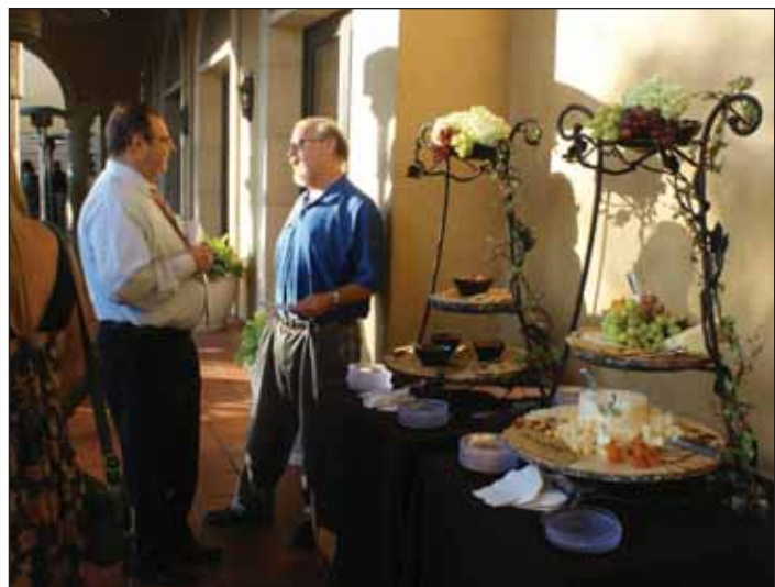
Fine cuisine from Merlin's Kitchen and Buddha's Belly added a flair of elegance to the evening.

donated by Red Robin & The Oaks Shopping Center,