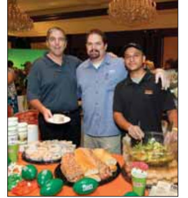
Togo's, Westlake Village