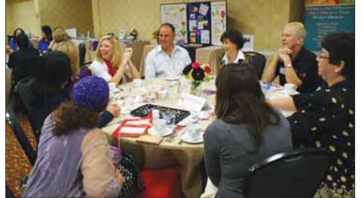
Breakfast guests were given time to promote themselves to fellow table guests and talk about volunteerism.