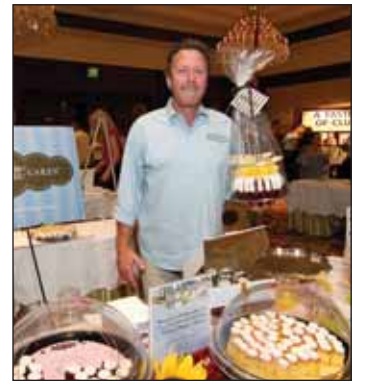
Nothing Bundt Cakes