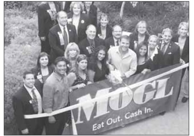
The Chamber Ambassadors joined MOGL at the Chamber for their ribbon cutting ceremony. To find more about MOGL call 888.664.5669 or visit them at www.mogl.com .