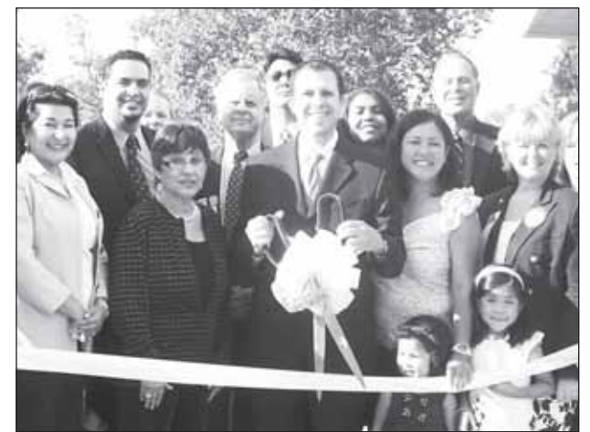
Chamber Ambassadors and the people of BrightStar of Thousand Oaks commemorated its ribbon cutting at the Chamber. To learn more about BrightStar, call 805.363.2533.