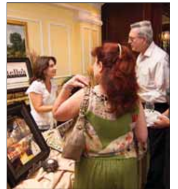
Vitello's Italian Trattoria