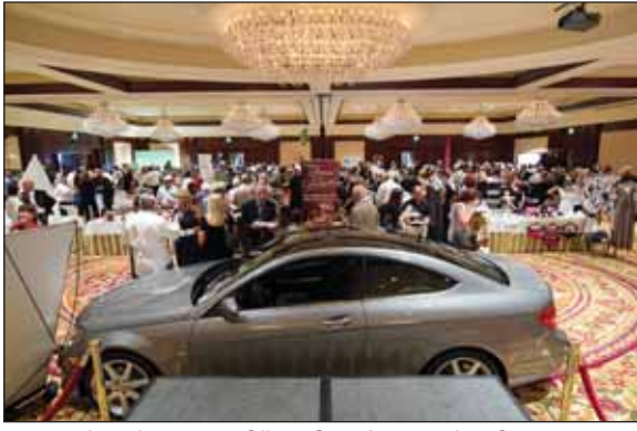
Lead sponsor Silver Star Automotive Group