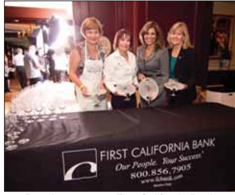
Premium sponsor First California Bank