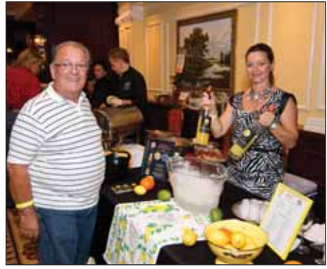
Ventura Limoncello Company