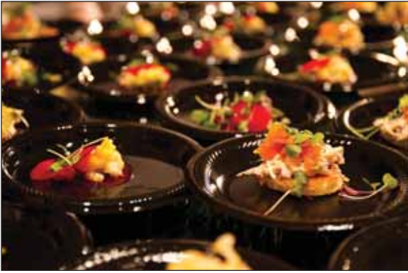
Gorgeous appetizers greeted guests.