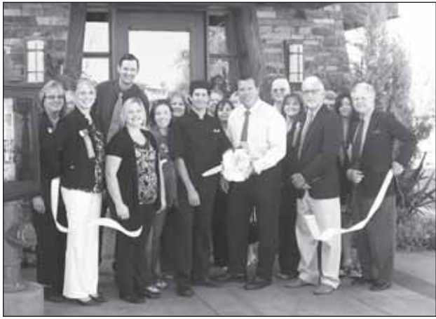
Lazy Dog Café welcomed Chamber Ambassadors to their restaurant at 172 West Hillcrest Drive in Thousand Oaks to celebrate their ribbon cutting. For reservations dial 805.449.5206 or visit them at www.lazydogcafe.com .