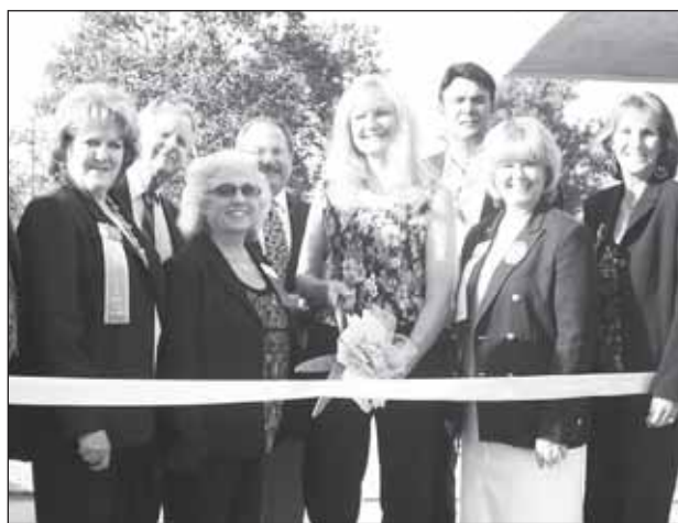
At Your Service celebrated their ribbon cutting with Chamber Ambassadors at the Greater Conejo Valley Chamber of Commerce. For more information call 805.208.4234 or visit www.atyourservicevc.com .