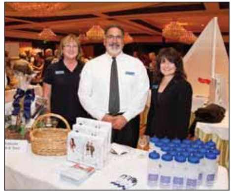
Montecito Bank and Trust