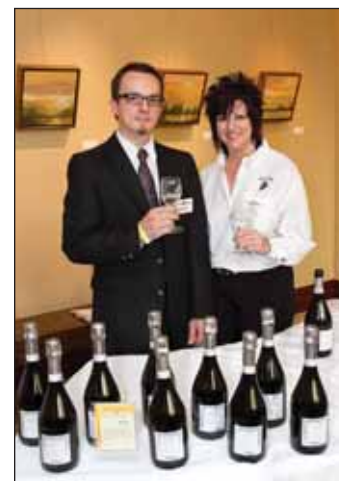
Total Wine and More poured champagne for VIP sponsor receptions.

The Chamber's Taste of Conejo was a resounding success with more than 1,300 guests gathered at the Four Seasons Hotel Westlake Village on September 27.