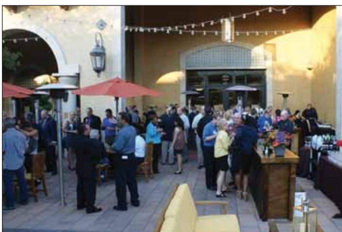
Mixer guests gathered for networking in the courtyard patio outside of the food court.