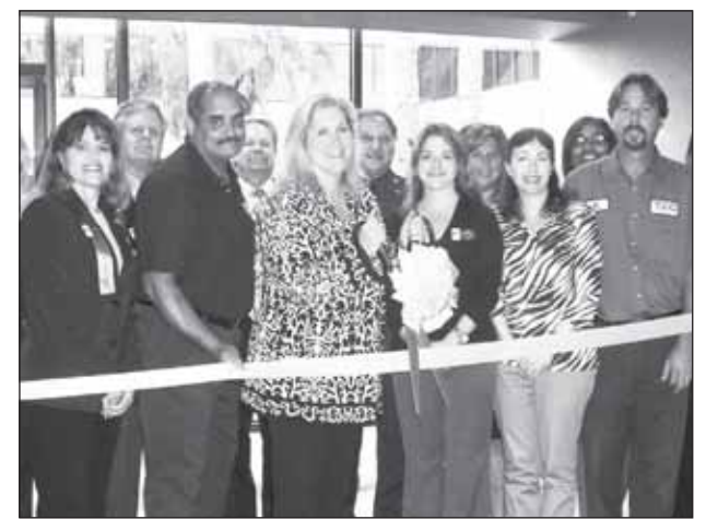
Chamber Ambassadors visited Topa Management Company at its location at 2801 Townsgate Road, Suite 139 in Westlake Village to commemorate its ribbon cutting. Call 805.495.1961 or visit www.topa-management.com for more information about Topa Management Company.