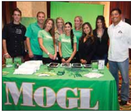
Major sponsor MOGL