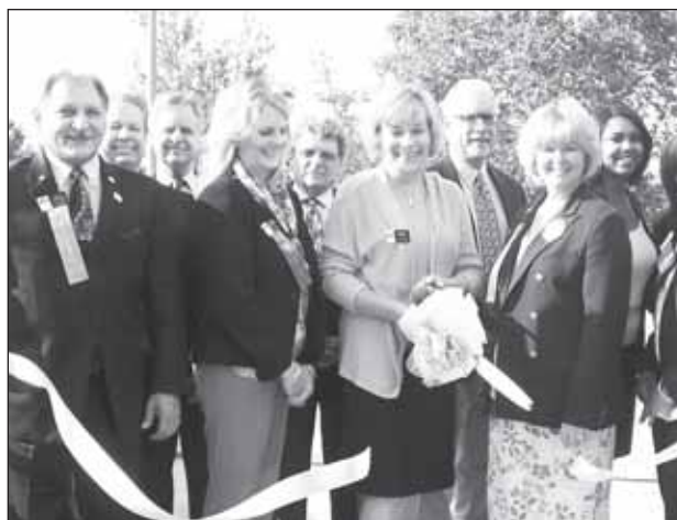
Language Web celebrated their ribbon cutting with the Chamber Ambassador at the Chamber office. For additional information contact Language Web at 818.735.0565 or visit their website www.language-web.net .