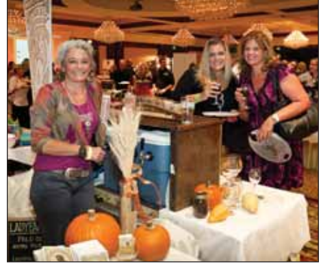
Ladyface Alehouse and Brasserie