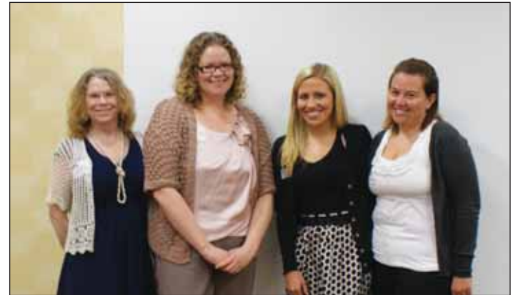
New Chamber members were introduced to the breakfast guests.