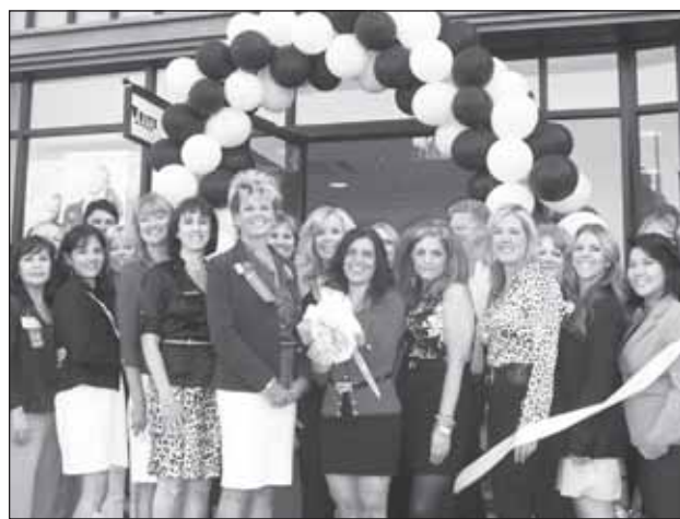
White House Black Market graciously hosted a ribbon cutting at their location at 2200 Thousand Oaks Blvd. in Thousand Oaks. For more information call 805.449.1192 or stop by their store.