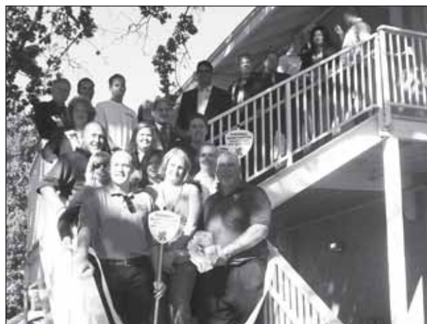
Chamber Ambassadors joined Cornwall Security Services at 3657 Thousand Oaks Blvd. in Thousand Oaks for their ribbon cutting. For more information about their service call 805.676.1828 or visit them at www.cornwallsecurity.com .