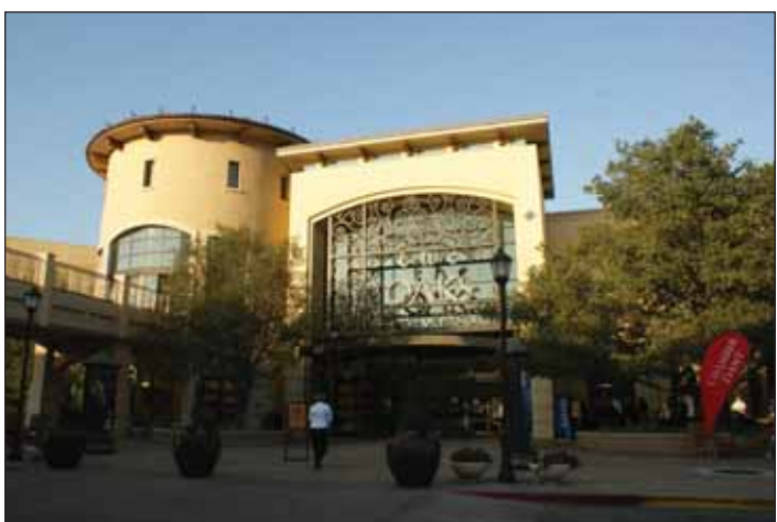
The Oaks shopping center provided a welcoming atmosphere for mixer guests.